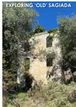
EXPLORING 'OLD' SAGIADA