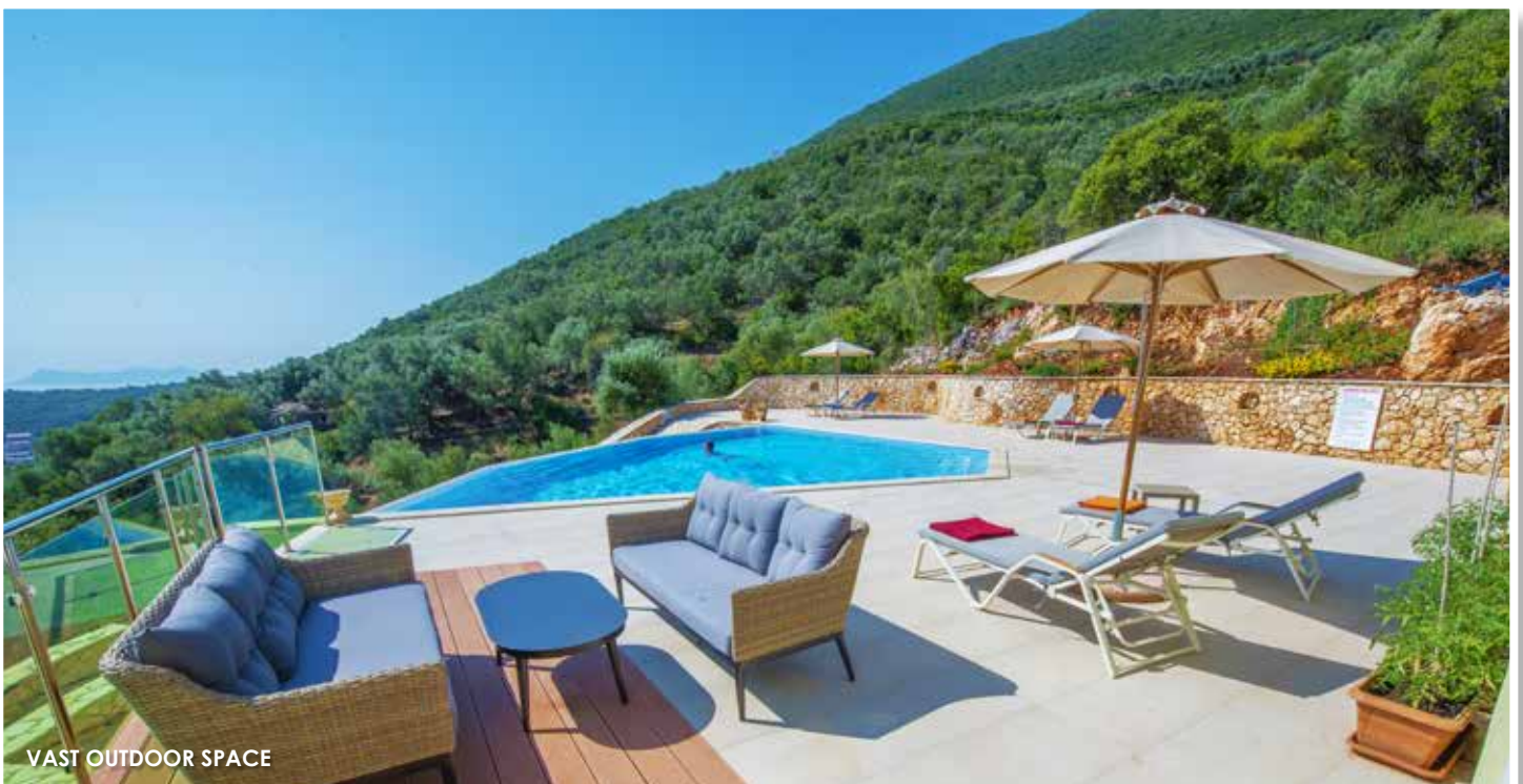
VAST OUTDOOR SPACE