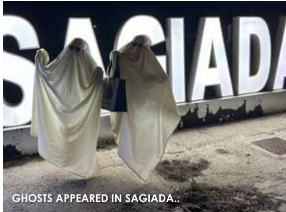
GHOSTS APPEARED IN SAGIADA..