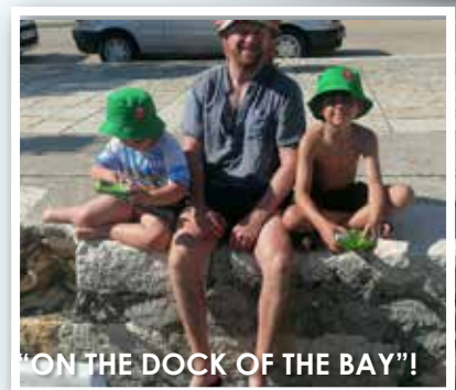
"ON THE DOCK OF THE BAY"!