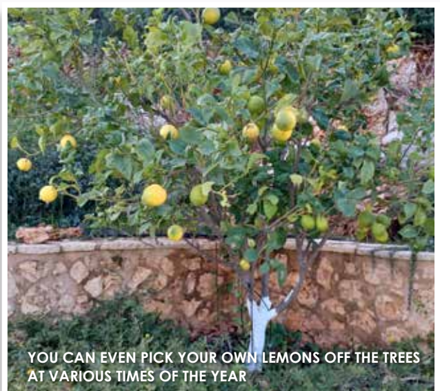
YOU CAN EVEN PICK YOUR OWN LEMONS OFF THE TREES AT VARIOUS TIMES OF THE YEAR