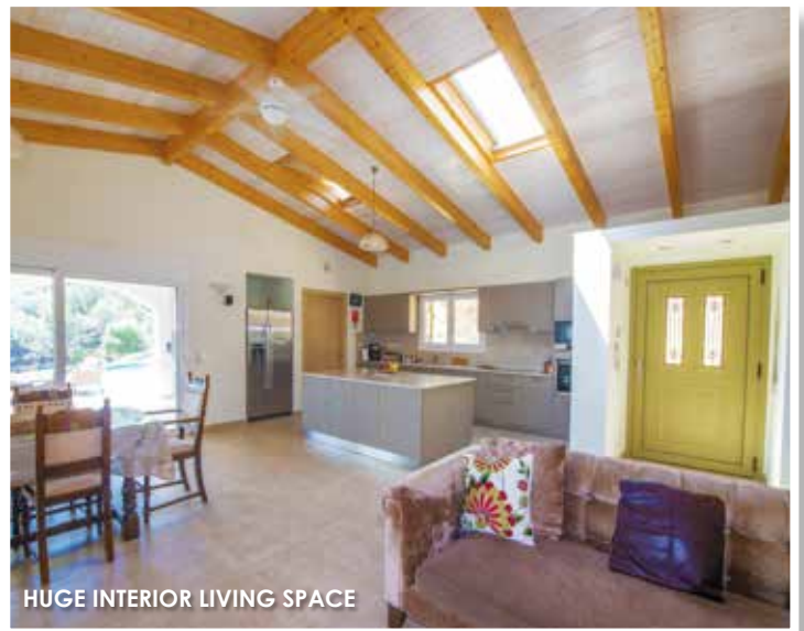
HUGE INTERIOR LIVING SPACE