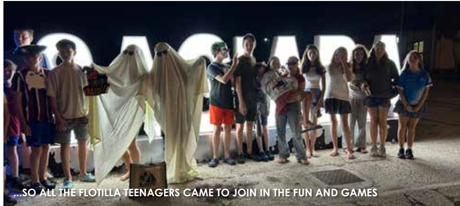
...SO ALL THE FLOTILLA TEENAGERS CAME TO JOIN IN THE FUN AND GAMES

One of the popular flotilla stops in the North Ionian area is Sagiada. Up on the mountain behind the harbour is "Old Sagiada" which is a real ghost town. It was on the front line of the Greek Civil War and originally built centuries ago in a hidden hollow out of sight of the sea. This was so that pirates could not see it and it became a very important town in the district of Thesprotia.