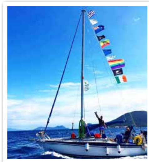
LEAD BOAT LOUTRAKI IN HER HEYDAY

Several were originally brought to the Mediterranean in the early 1980's for a company called "Seven Seas Sailing" in the old Yugoslavia.