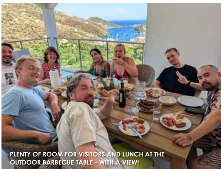
PLENTY OF ROOM FOR VISITORS AND LUNCH AT THE OUTDOOR BARBECUE TABLE - WITH A VIEW!

10% DISCOUNT FOR PREVIOUS SAILING HOLIDAYS CLIENTS