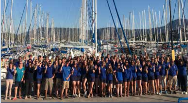
OUR GREEK TEAM 6