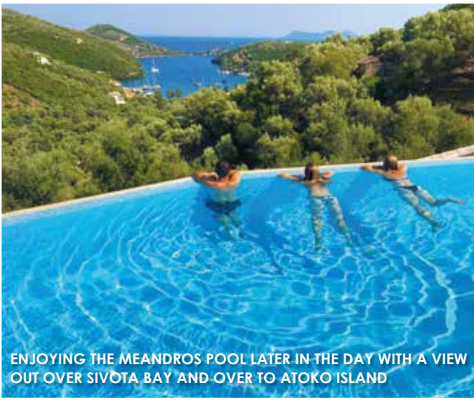
ENJOYING THE MEANDROS POOL LATER IN THE DAY WITH A VIEW OUT OVER SIVOTA BAY AND OVER TO ATOKO ISLAND