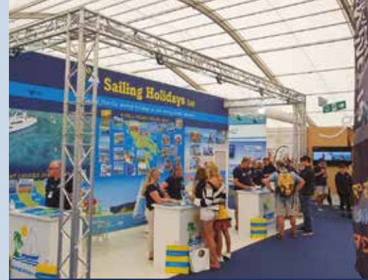
BOAT SHOWS 4