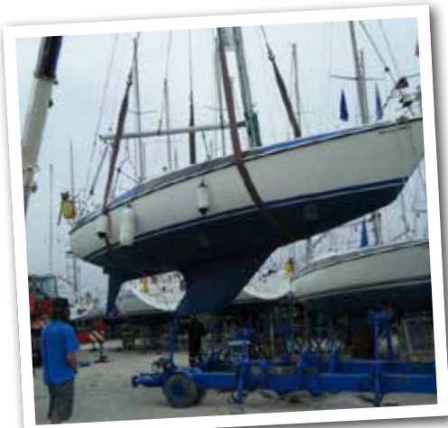
LEAD BOAT KIRKI COMES ASHORE

If anybody is interested in any of these boats please let us know. Loutraki, Kirki and Kyra are 'projects' and Helen and Maria are up and running