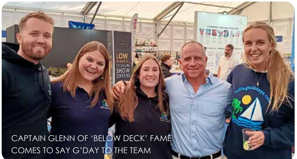
CAPTAIN GLENN OF 'BELOW DECK' FAME COMES TO SAY G'DAY TO THE TEAM

Who knew we'd be watching him on our TV screens 30 years later! It was great to chat to him!