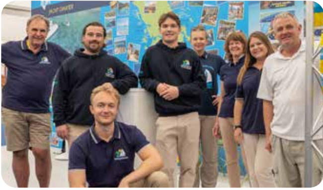
SOME OF OUR 2024 BOAT SHOW TEAM

We weren't just on our stand, but also answering questions on the Foredeck Stage in relation to the RYA 'How to Get Afloat' programme.