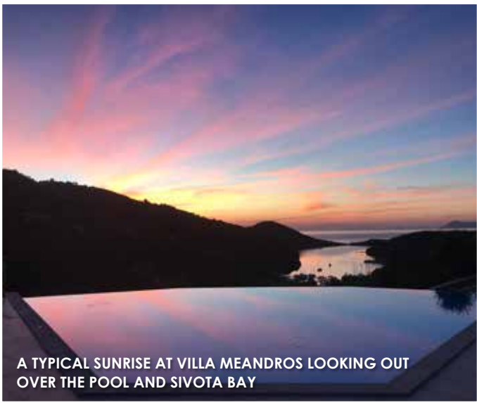
A TYPICAL SUNRISE AT VILLA MEANDROS LOOKING OUT OVER THE POOL AND SIVOTA BAY